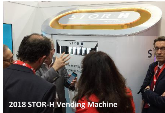
2018 STOR-H Vending Machine