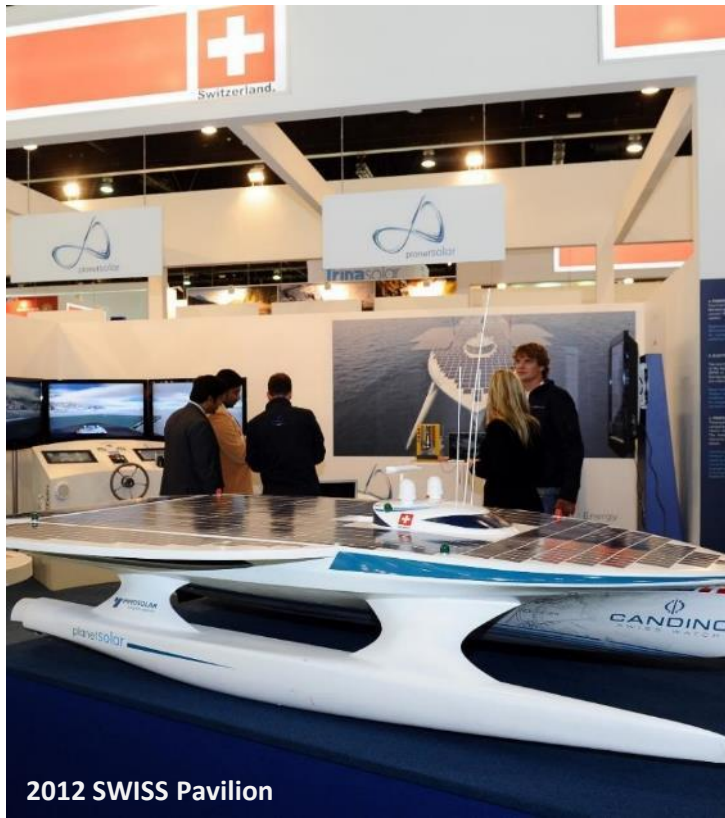
2012 SWISS Pavilion