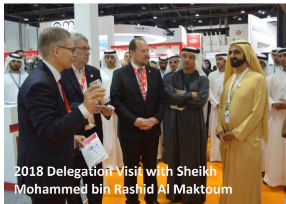
2018 Delegation Visit with Sheikh Mohammed bin Rashid Al Maktoum