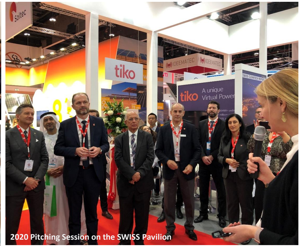
2020 Pitching Session on the SWISS Pavilion